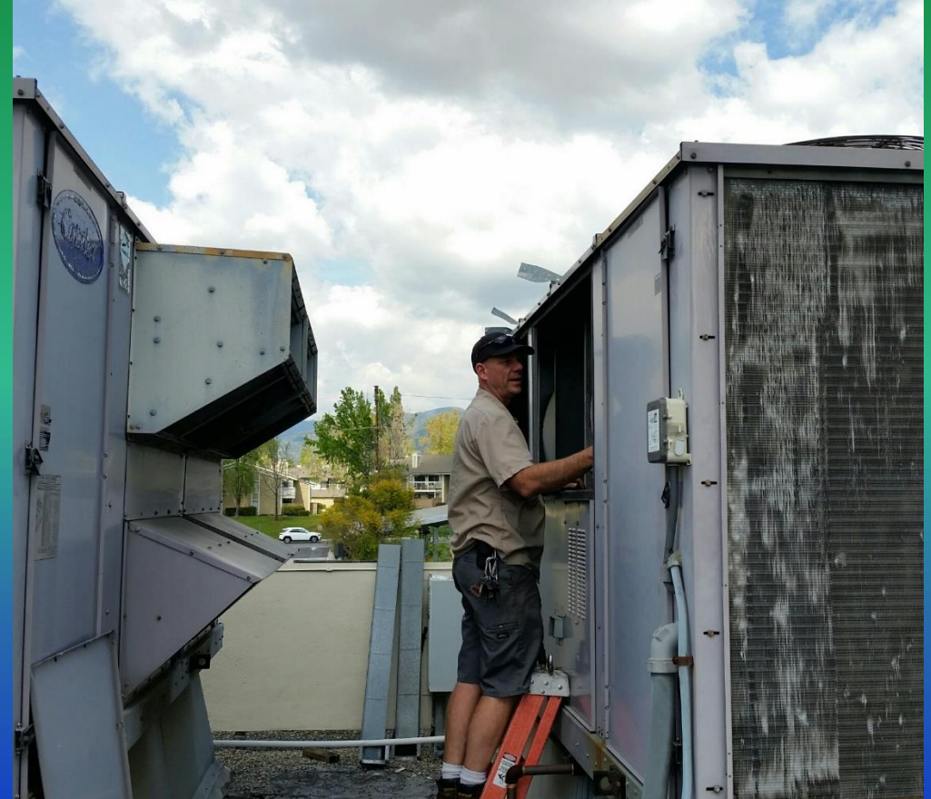
Installing New Unit