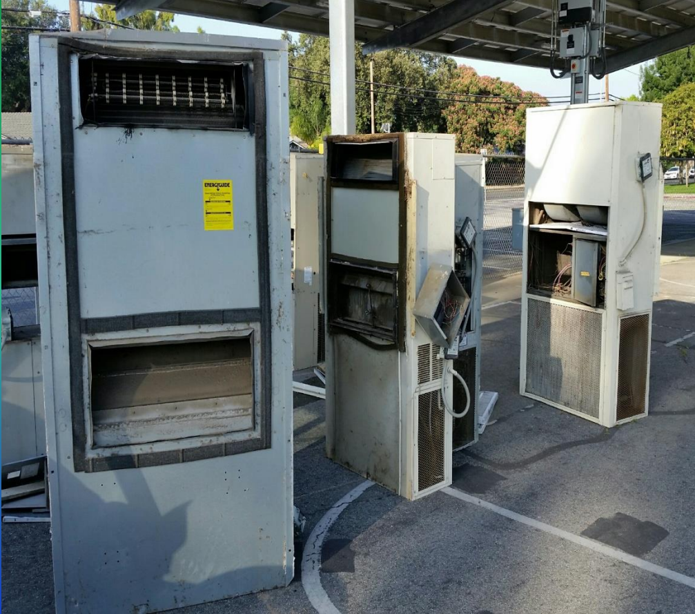
Old HVAC Units