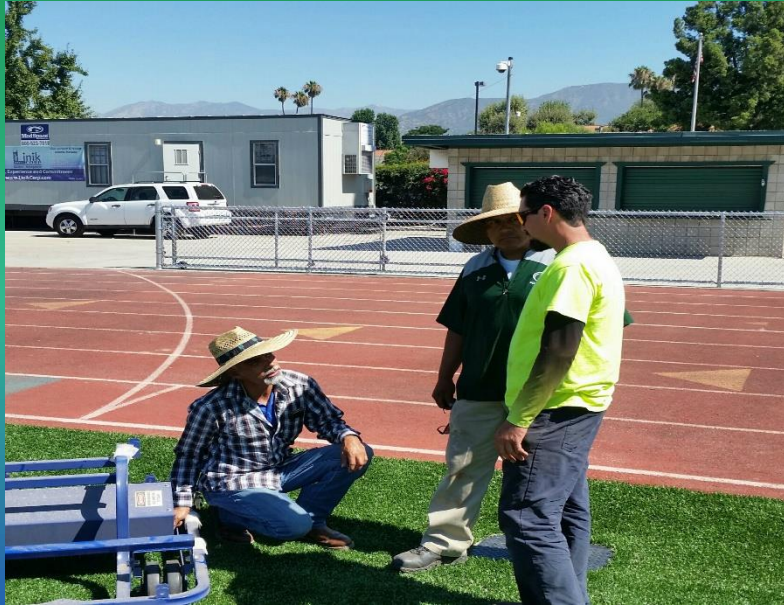
Synthetic Turf Training