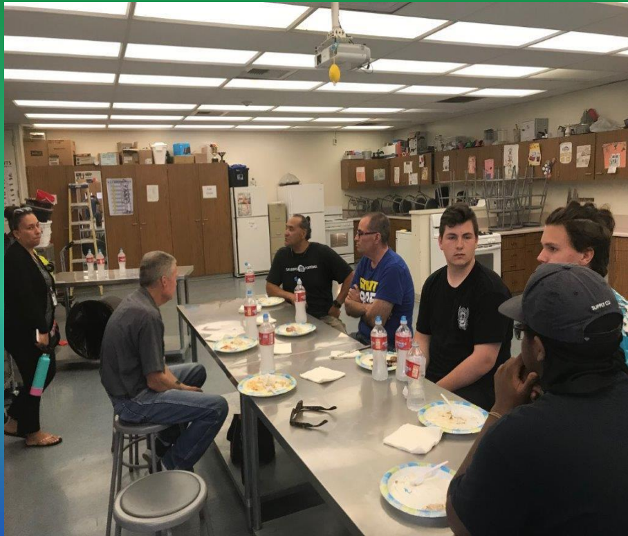
Head Custodian Lunch for Summer Crew