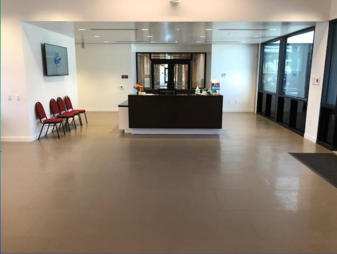
District Office Lobby