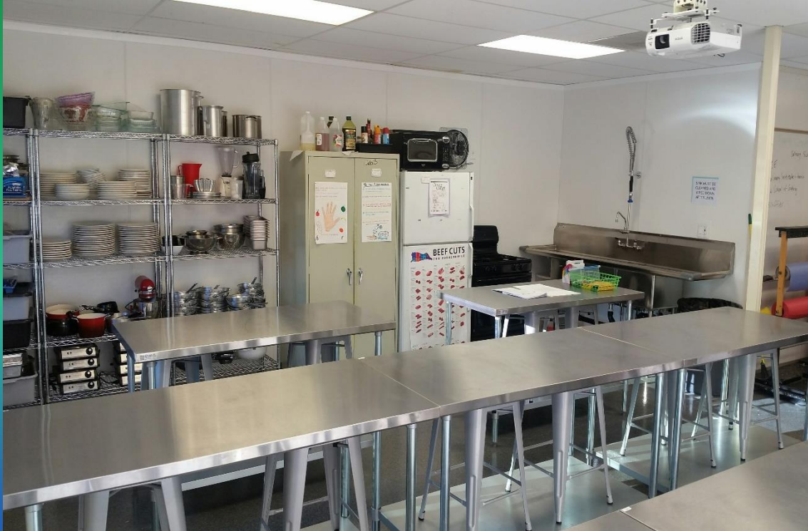
Ed Jones Culinary Room