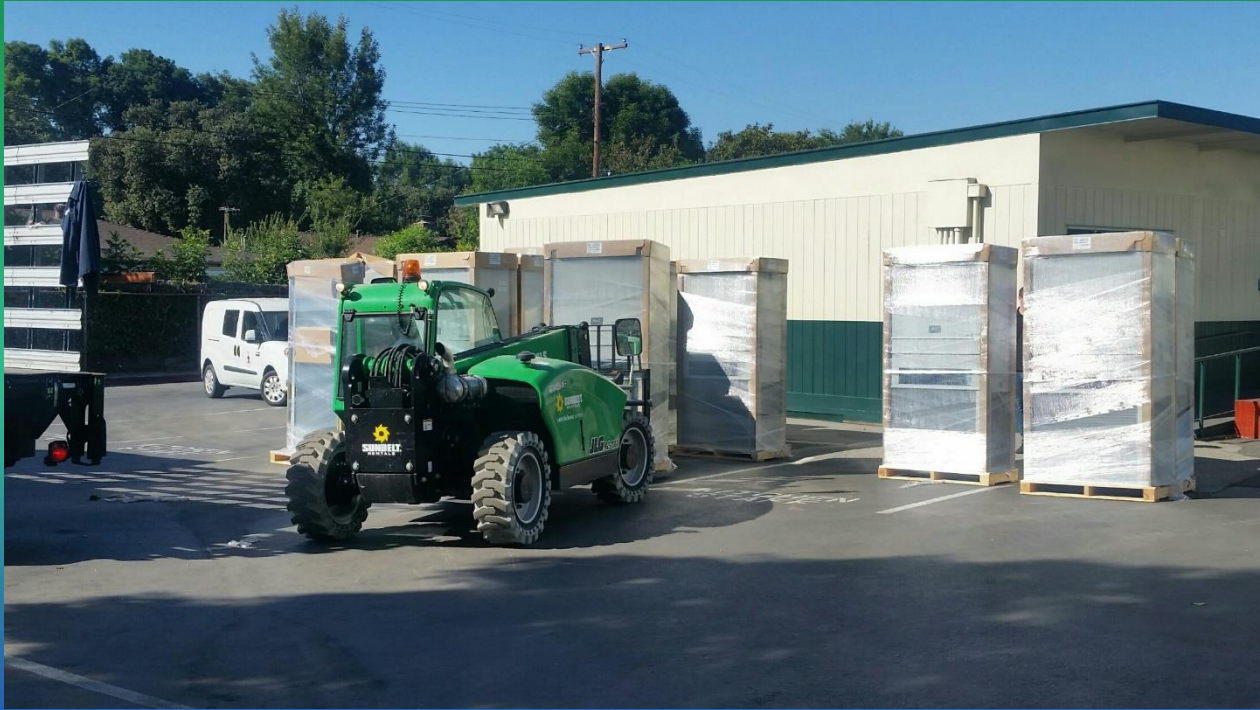
New Air Conditioning Units