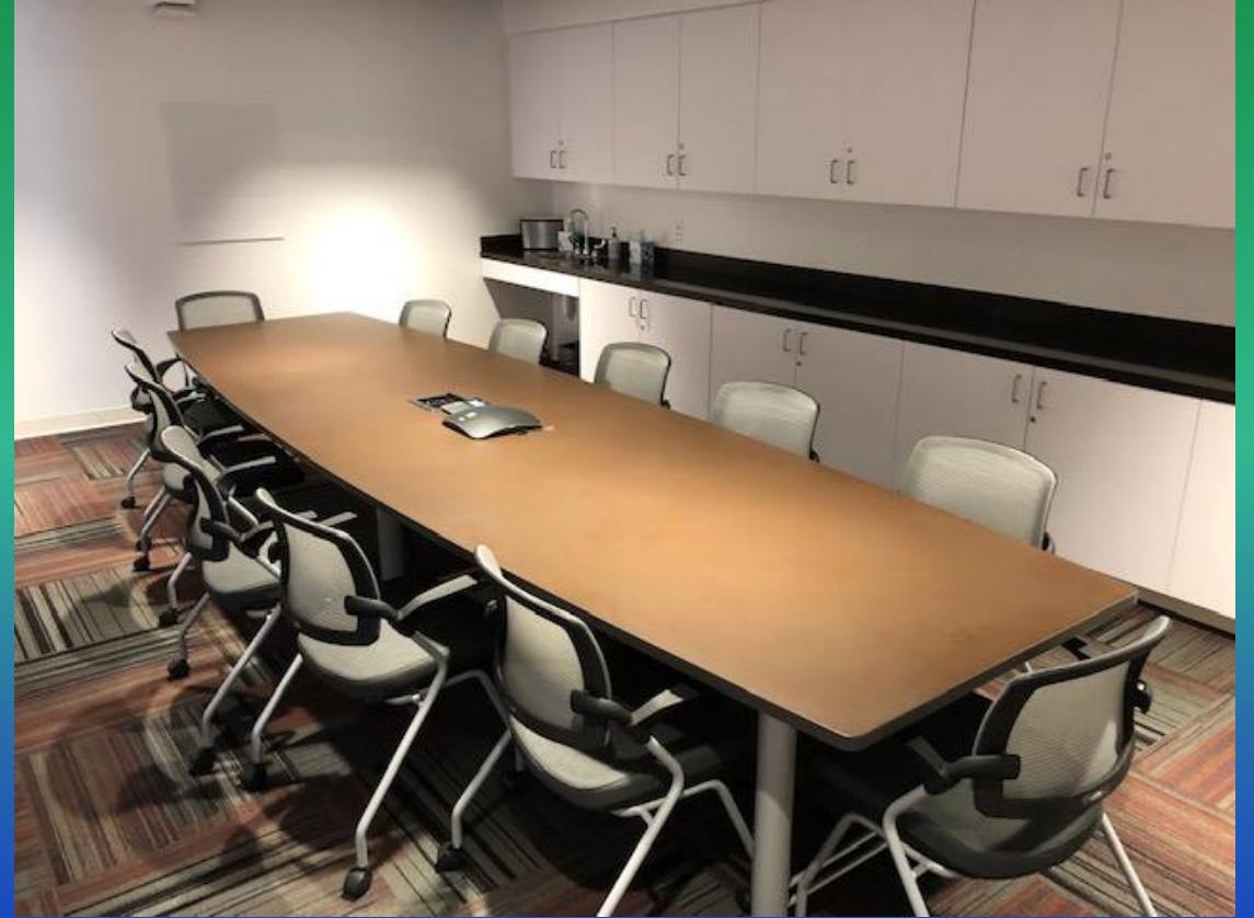
District Office Conference Room