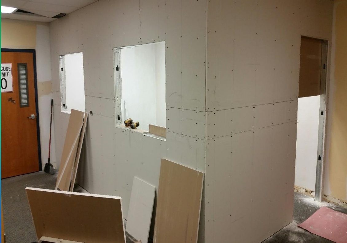
Lone Hill Counselor Office