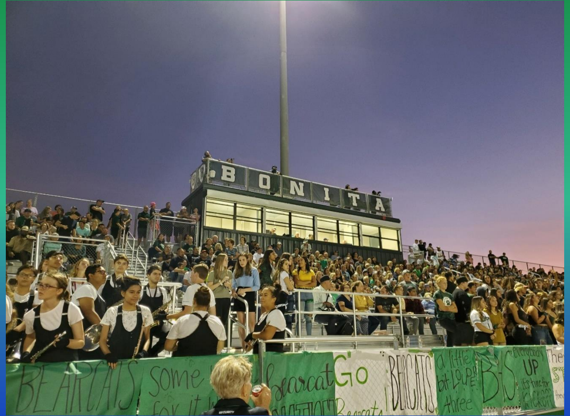
Bonita High School Football Stadium