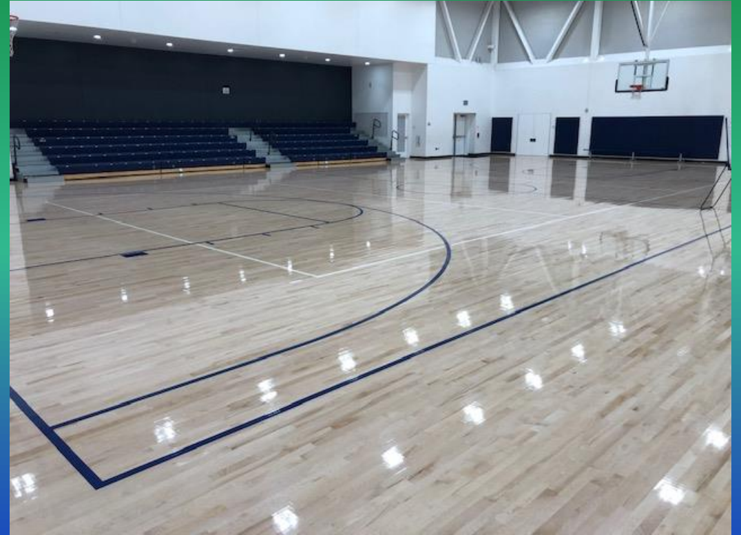
Lone Hill Gym Floor Refinishing