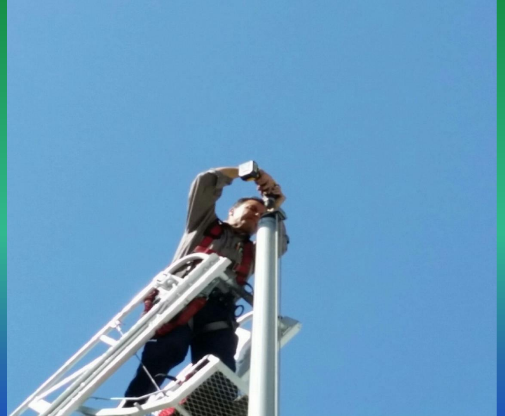
San Dimas High Flagpole Light Repair