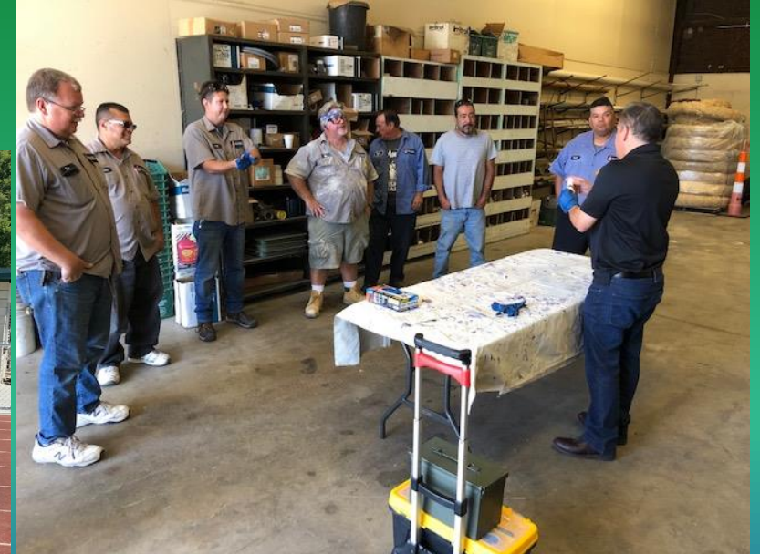
Maintenance Pipe Adhesive Training