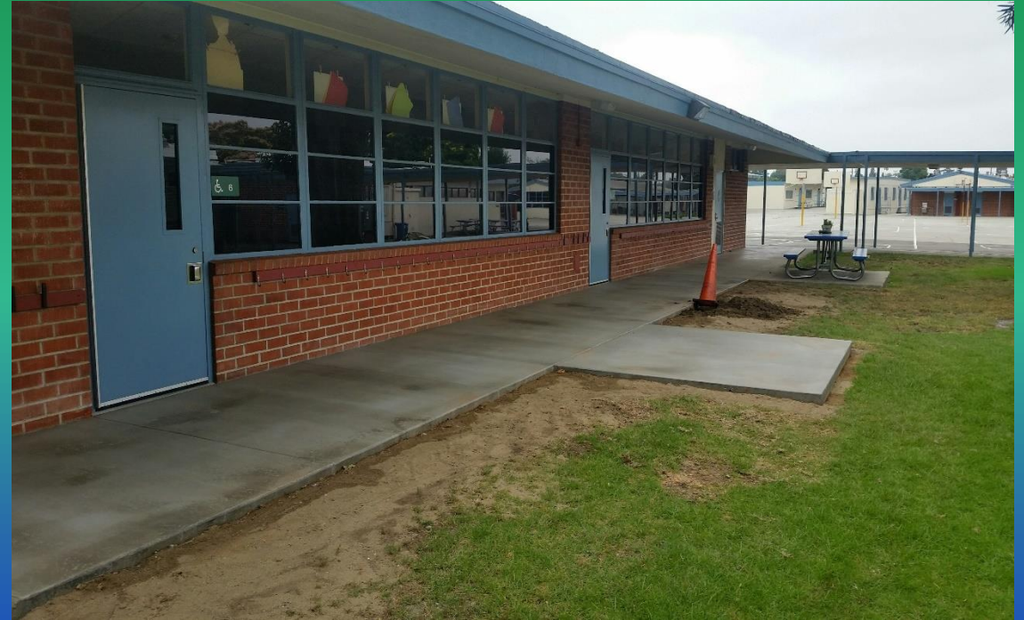
Grace Miller Sidewalk