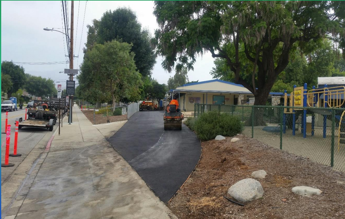
Ekstrand Bus Turnaround