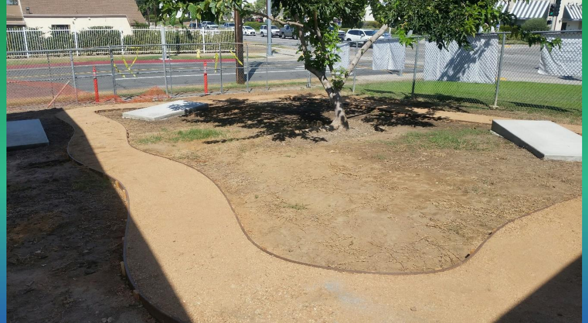
Gladstone Reading Garden