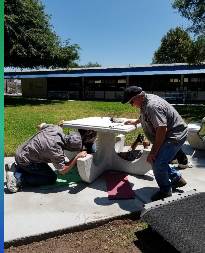
Ekstrand Lunch Tables