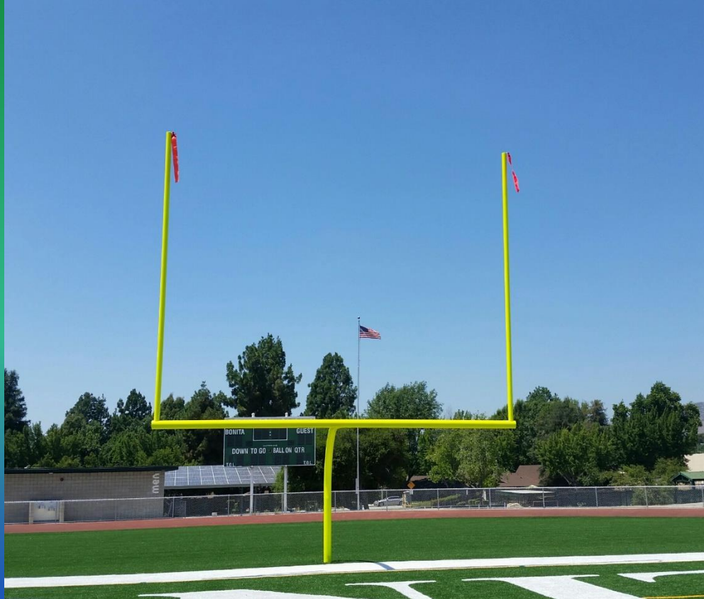
Bonita High Goal Post Painting