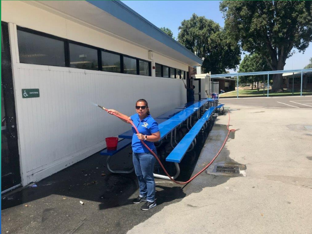
Washing Exterior Areas