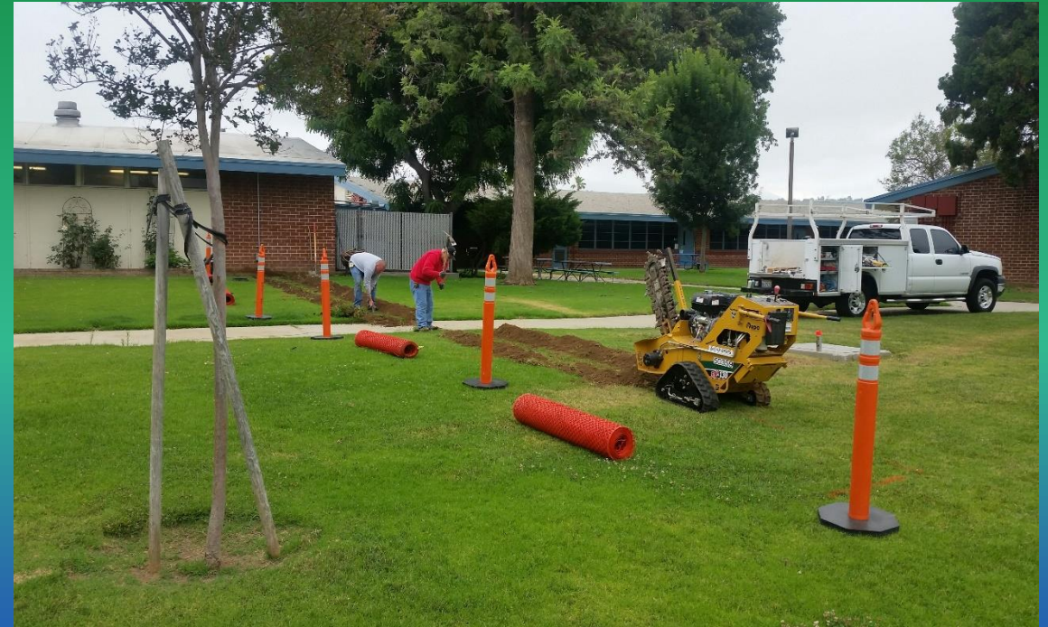
Grace Miller Marquee