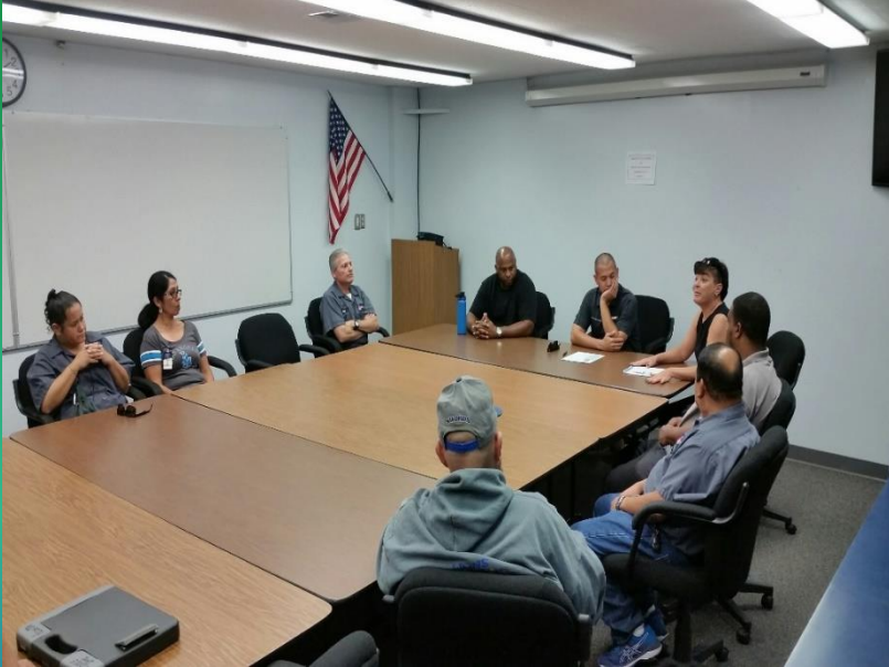
Custodial Chemical Handler Training