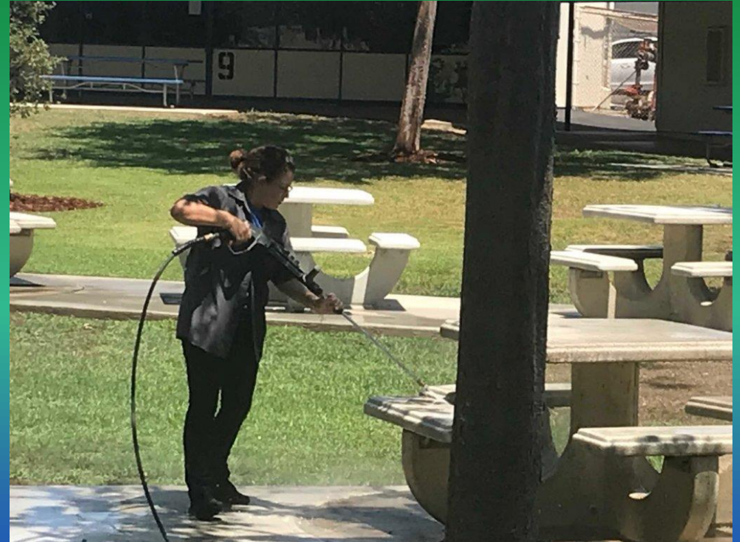
Pressure Washing Lunch Tables