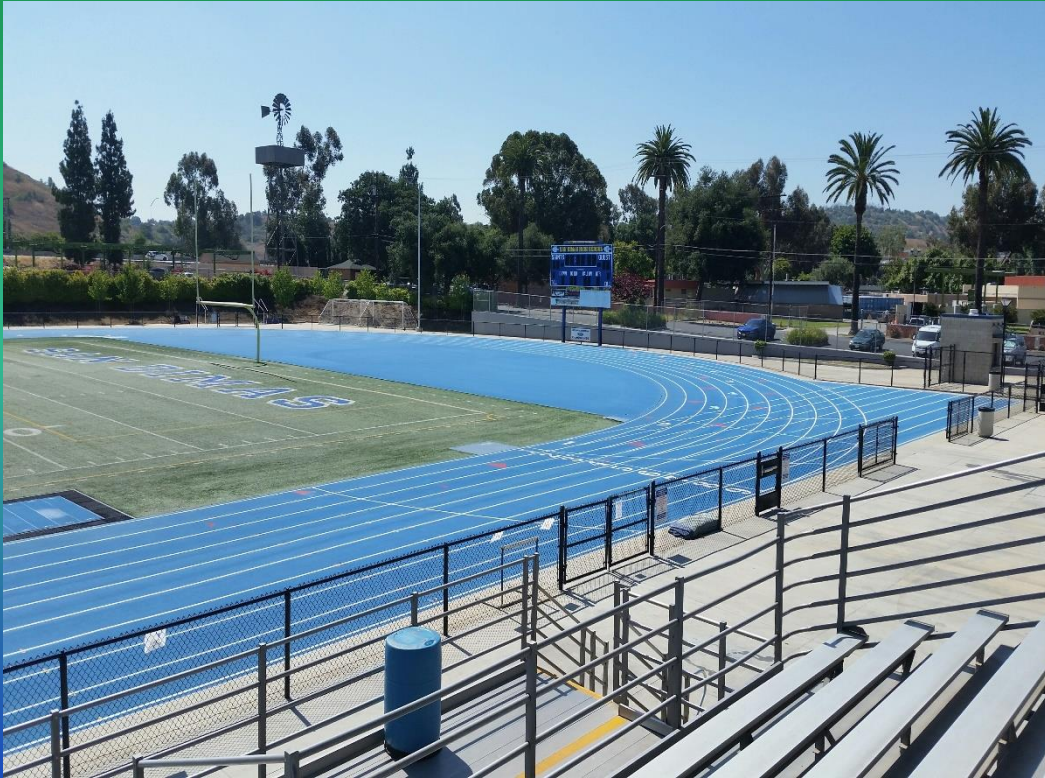
San Dimas Track Power Washing