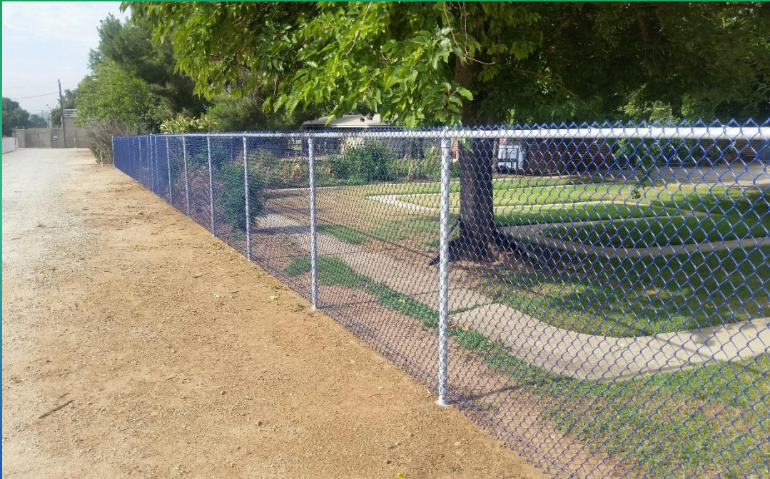
Allen Ave Kindergarten